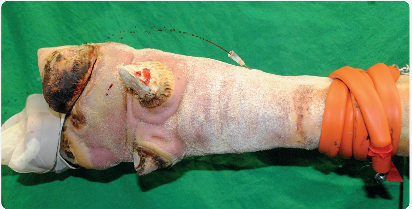
Figure 3: Intravenous regional anaesthesia on the hind limb of a Simmental cow. After applying a rubber tourniquet (Esmarchschlauch), a superficial toe vein is punctured and 20 to 25 mL of a 2% procaine hydrochloride solution is injected.

After allowing some blood to escape through the cannula, inject (without prior aspiration) 20 to 25 mL of a 2% procaine hydrochloride solution WITHOUT a vasoconstrictor agent. The tourniquet should be removed after 90 minutes. 34